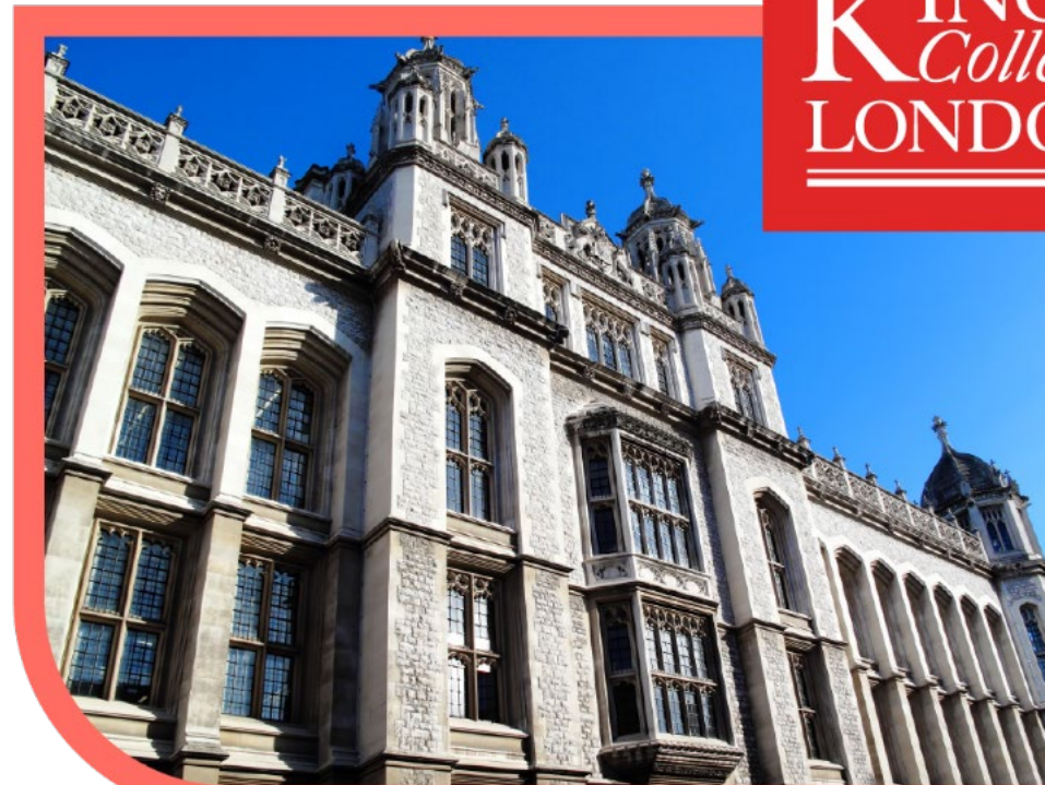
King's College London