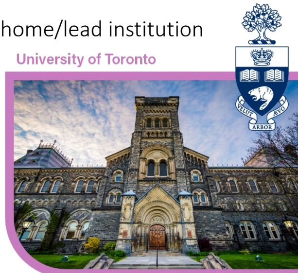
University of Toronto