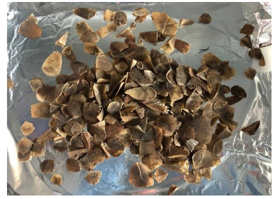
Image 4. A selection of White-bellied pangolin ( Phataginus tricuspis ) from a seizure in Hong Kong