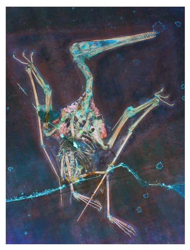
Figure 2. Late Jurassic pterodactyloid → pterosaur in flight.

This pterosaur used a muscular wing root fairing to achieve additional flight performance benefits, including a more powerful flight stroke and sophisticated control of the wing's shape. Image credit: Alex BOERSMA & PNAS.