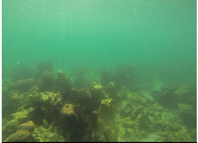
Image 1: Low visibility is due to Pearl River influence and pollution.