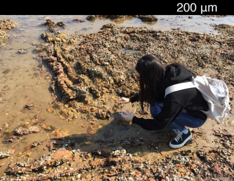
Image 3: Dr Yuanyuan Hong was collecting sediment sample for laboratory analysis.