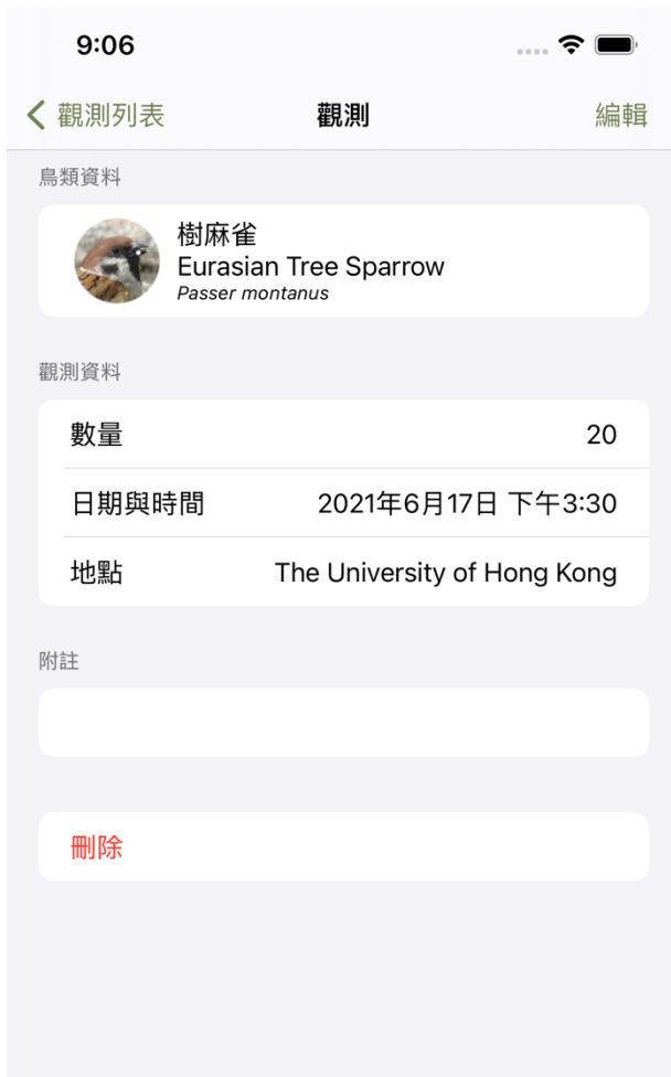
Photo 4. The public can systematically record their observations and birding experience in the app.