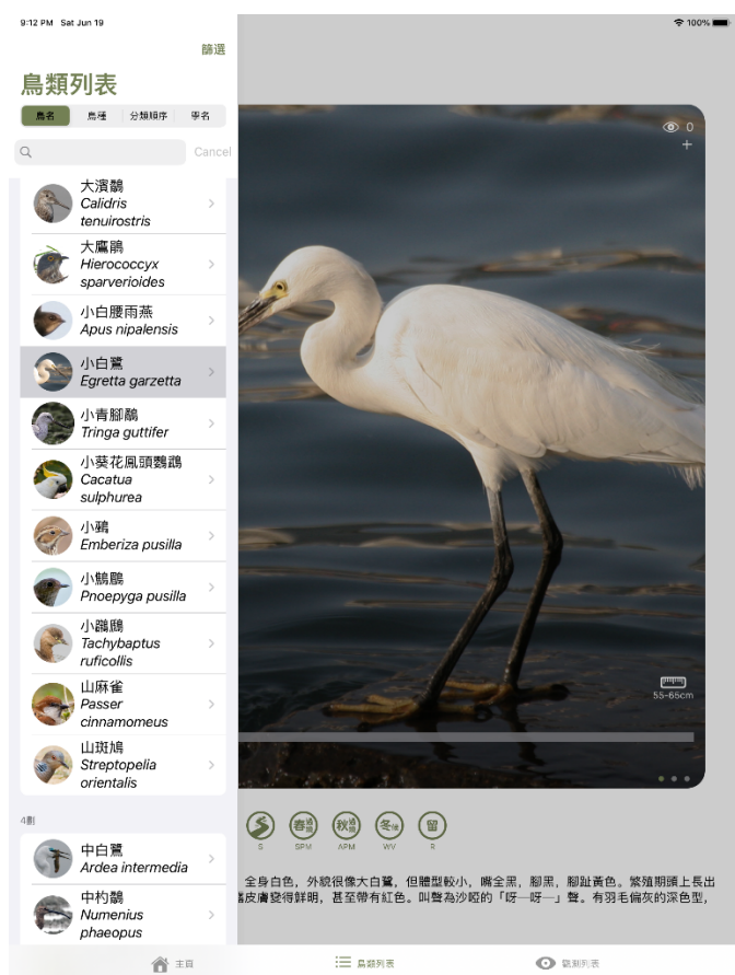
Photo 2. Information of over 240 bird species are available in the app, covering most of the common species found in Hong Kong.

Images download: https://www.scifac.hku.hk/press