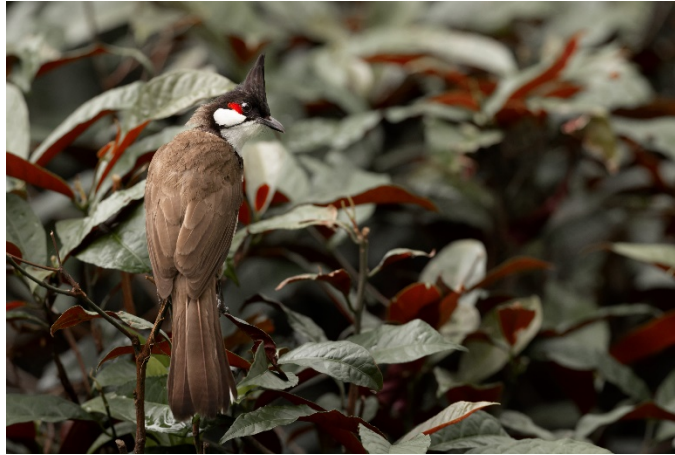
Photo 1. Red-whiskered Bulbul, a common and widely distributed Hong Kong resident usually seen in woodland, open country and urban areas.

Nowadays, citizens often stick to the flat screens of mobile phones. To reconnect people in the city with nature through their mobile devices, the School of Biological Sciences of The University of Hong Kong (HKU) and the Hong Kong Bird Watching Society jointly developed the iOS app "HKBirds: Birds of Hong Kong". The app facilitates observation, identification, recording and sharing of bird records at anytime and anywhere. It encourages users to observe and reconnect with nature, raises public awareness on biodiversity and enhances appreciation of nature. The app is available for free download worldwide and acts as a field guide for the birds of Hong Kong.