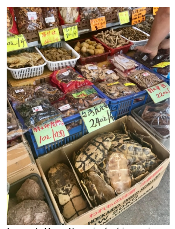
Image 4. Hong Kong is the biggest importer and Image 5. Many marine species are the second-biggest exporter of traditional medicine globally.