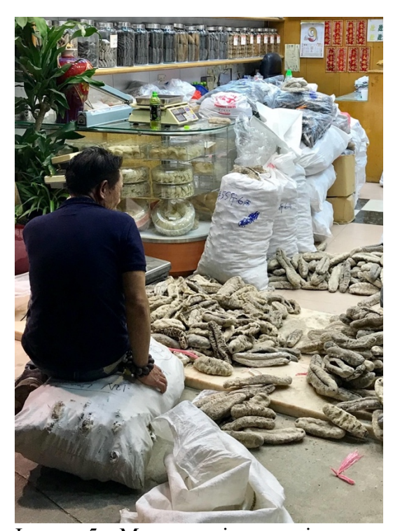
traded at high volumes and values and without species-level data - a scenario in which over-exploitation can go unnoticed.