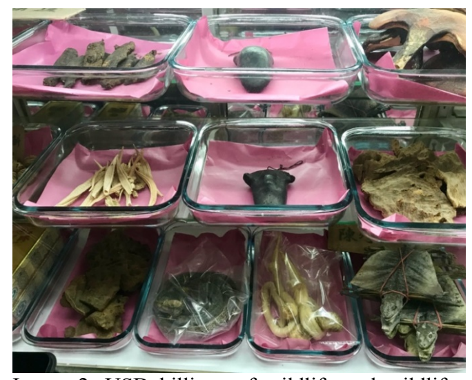
Image 2. USD billions of wildlife and wildlife Image 3. Co-author of the study products are traded internationally without species-level traceability.