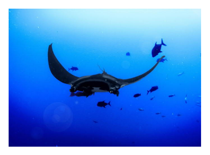
Image 4: An example of pelagic ocean ecosystem 1.

Image 3: Biodiversity patterns with latitudes in three different time periods. Note the equatorial "dip" in the pre-industrial time (green) and 2090s (red), but not in the last ice age (blue).