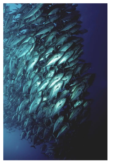
Image 5: An example of pelagic ocean ecosystem 2.

Image 4: An example of pelagic ocean ecosystem 1.