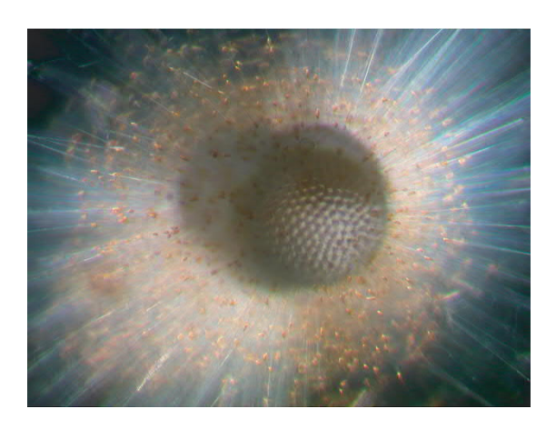
Image 1: A living planktonic foraminifera, Globigerinoides sacculifer.