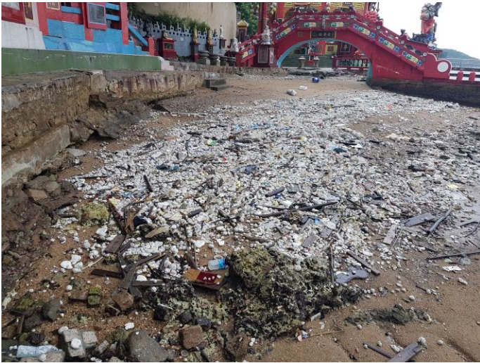
Image 1: In early August 2017, there were a lot of palm stearin being found on the shore of Repulse Bay.