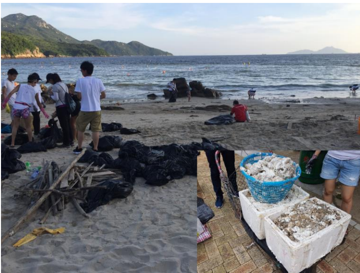
Image 2: Our results highlighted the importance of the immediate action for removal of the palm stearin from the shores jointly by the government and citizens, because these could minimize their long-term impacts to the marine environment.