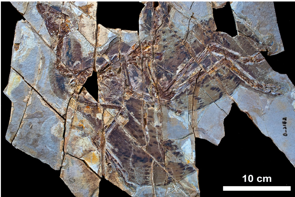
Figure 2. A pristine specimen of the feathered dinosaur Anchiornis huxleyi showing its colour patterns. Melanin was first identified from an animal from this species.