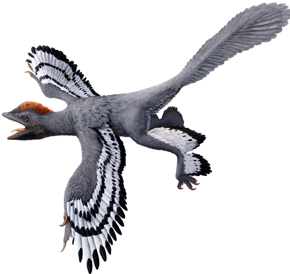
Figure 3. A life reconstruction of the feathered dinosaur Anchiornis huxleyi based on fossil evidence of its colour and patterning. This evidence included inferences about melanin pigments.