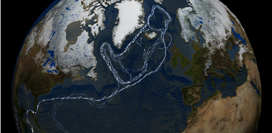
Image 1: Atlantic meridional overturning circulation.