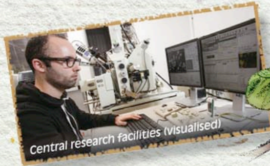
Central research facilities (visualised)

Facilities in our new science building that need support include: