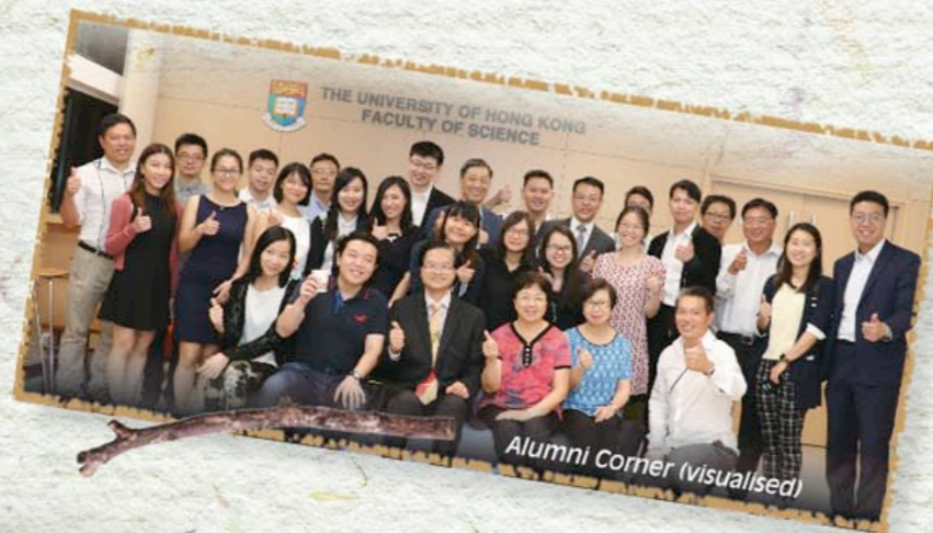
Alumni Corner (visualised)