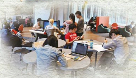
Learning Commons for postgraduate students (visualised)