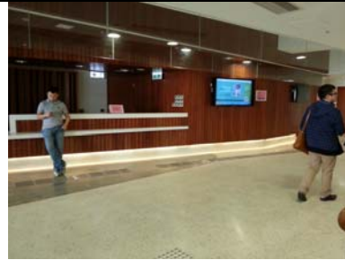
(8) Turn right