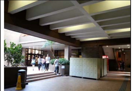
(6) Turn left until you see this