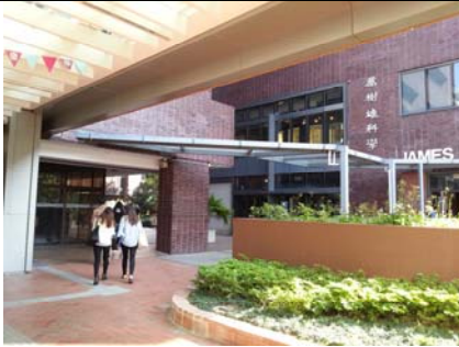
(4) Walk pass James Hsiung Lee Science Building