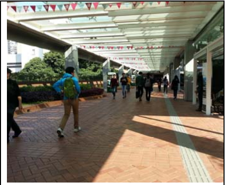
(3) Keep walking until you see James Hsiung Lee Science Building