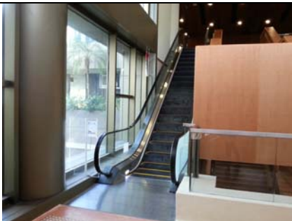
(10) Take this escalator