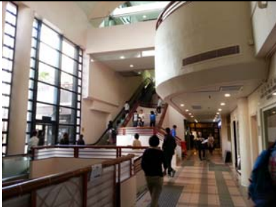
(7) Take the escalator