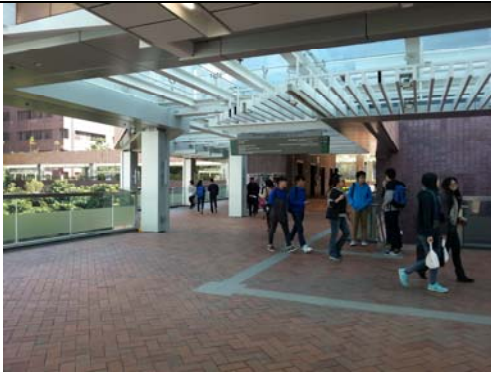
(1) This is what you see at exit A2 of HKU MTR station