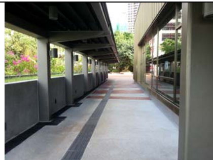
(11) Walk along the covered walkway