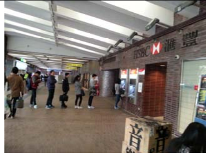
(5) You should be able to see HSBC on your right