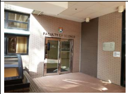
(12) Faculty of Science is at the end of the walkway