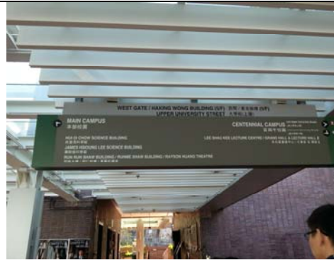
(2) You are going to the Main Campus which is on your left