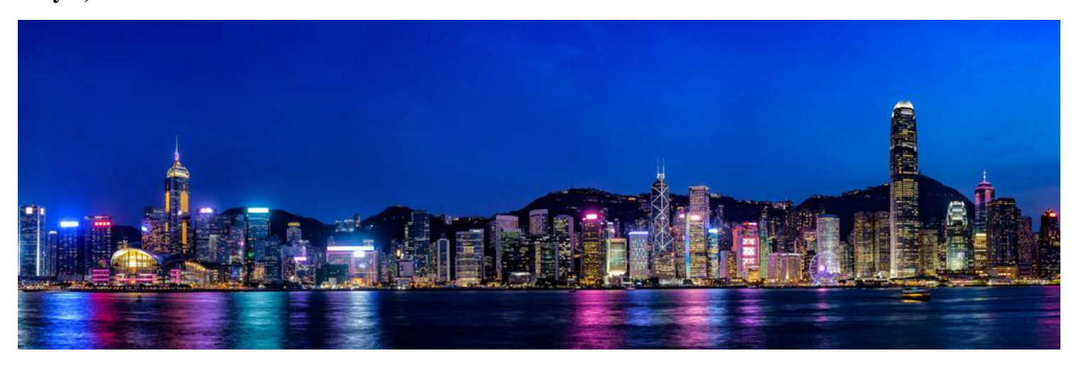
Image 1: Hong Kong has been chosen as the location for the Asia-Pacific Regional IAU Meeting (APRIM), an international meeting of prestigious International Astronomical Union, set to take place in the spring of 2026.

The Asia-Pacific Regional IAU Meeting (APRIM), an international meeting of the International Astronomical Union (IAU), will be held in Hong Kong in the spring of 2026. The final decision was made by the IAU Executive Committee at their Meeting in Helsinki on April 25, 2024, and transmitted to the proposers based at the Laboratory for Space Research (LSR) at The University of Hong Kong (HKU) on the same day. This marks the first time that the APRIM is being held in the Hong Kong Special Administrative Region (HKSAR), following the IAU General Assembly held in Beijing in 2013.